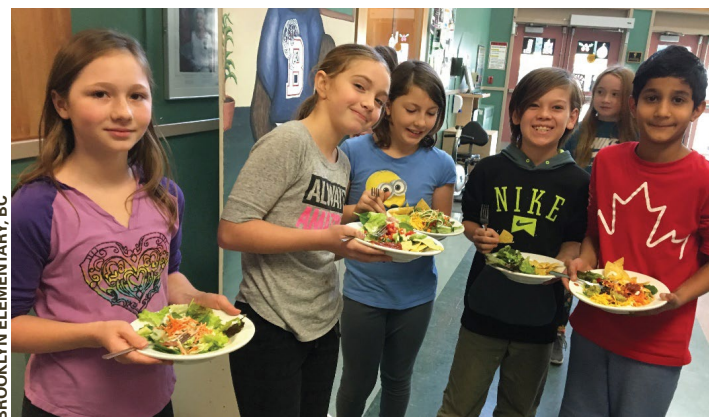
BROOKLYN ELEMENTARY, BC