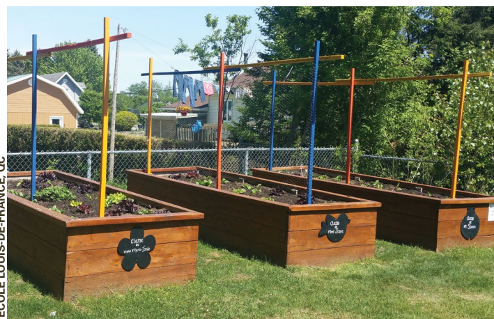
ÉCOLE LOUIS-DE-FRANCE, QC

Farm to School: Canada Digs In! is a pan-Canadian multi-sectoral chronic disease prevention initiative.