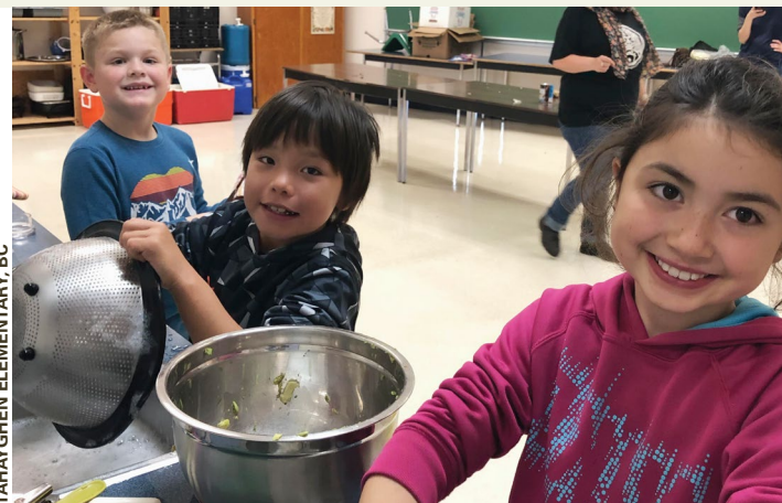
TAHAYGHEN ELEMENTARY, BC