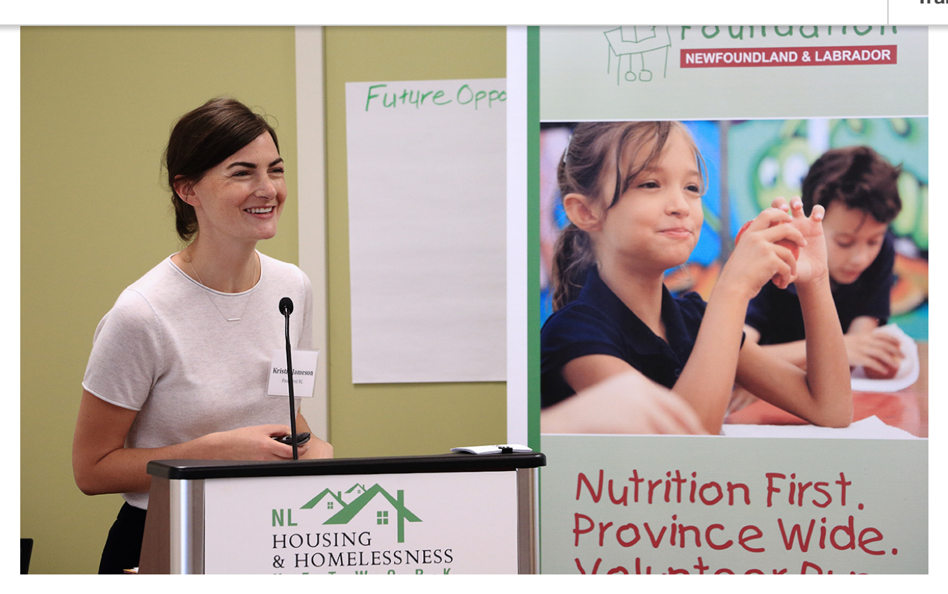
Farm to School Month had a fantastic launch in Newfoundland and Labrador as educators, health professionals, representatives from school food suppliers and other leaders gathered in St John's for a historic event - the first ever provincial school food gathering. READ MORE